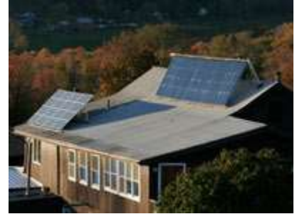
Renewable energy system at the Apple Pond Farm (NY)

Experimentation with burning used vegetable oil and other biofuels for space heating is currently underway.