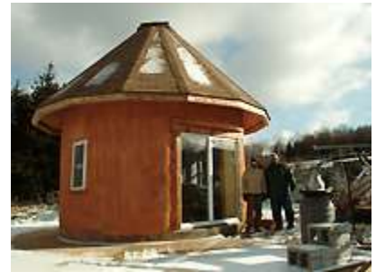
Our round straw bale house