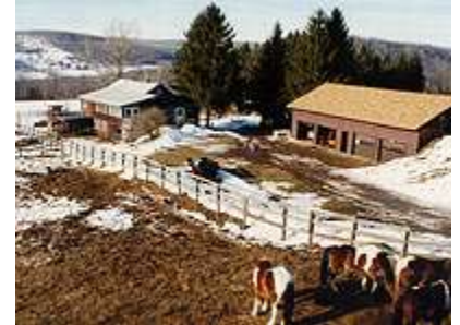
The Farm in New York State - Apple Pond Farm and Renewable Energy Education Center